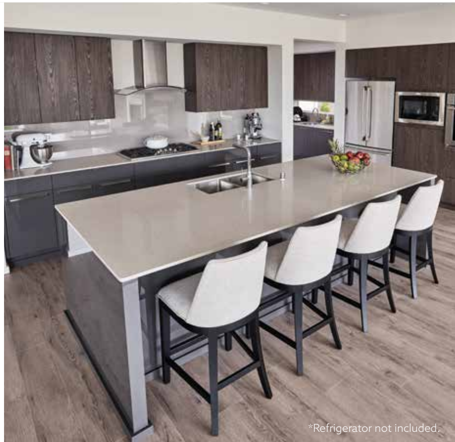
*Refrigerator not included.