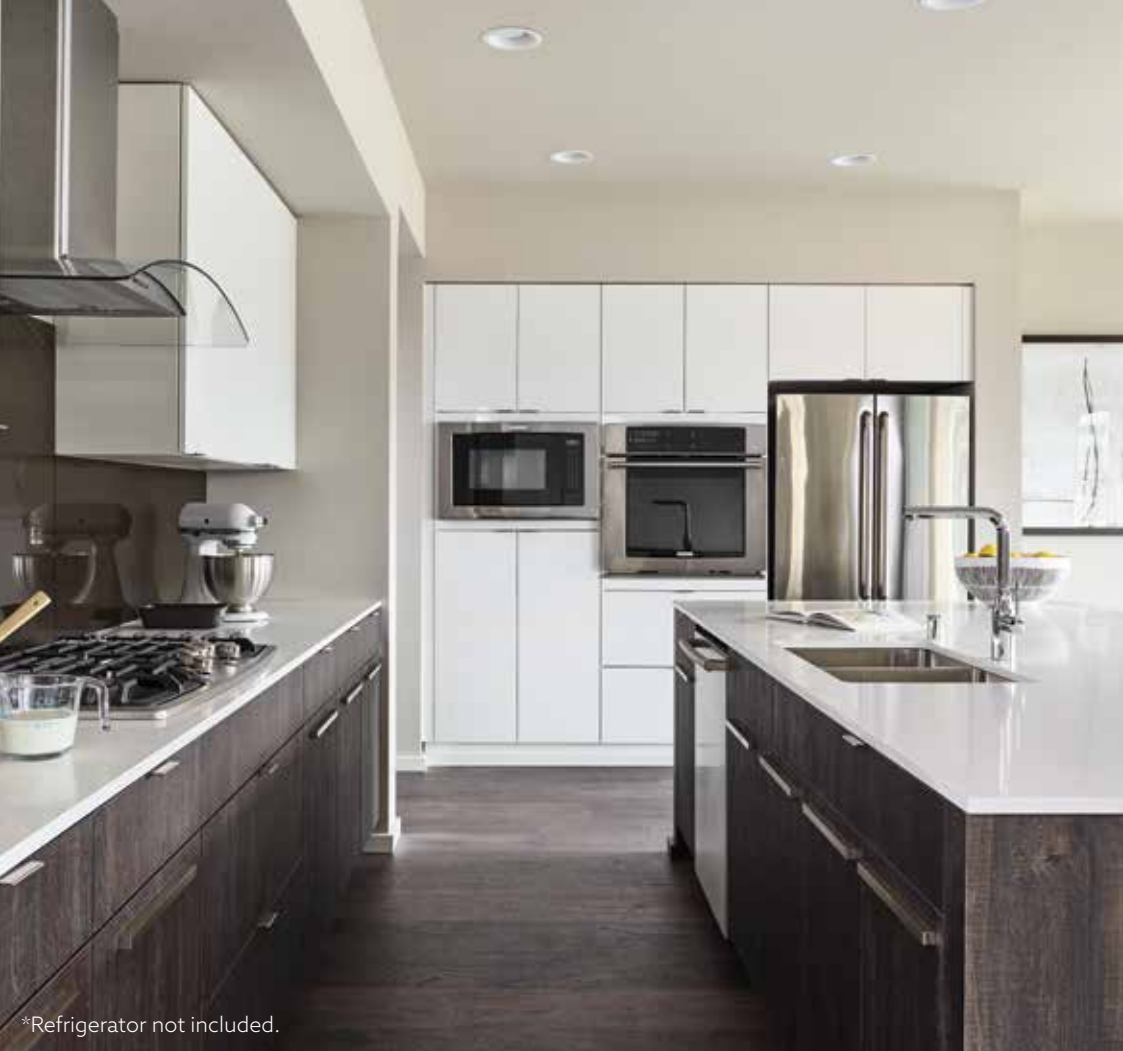
*Refrigerator not included.